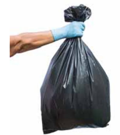
Bio Degradable Garbage Bag