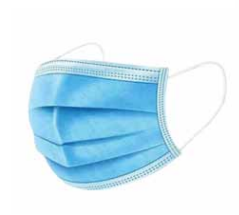
3 PLY Surgical Mask