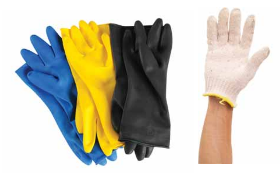
Heavy Duty Gloves