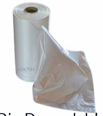
Bio Degradable Bag On Roll