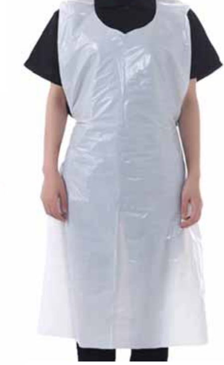
PE Disposable Sanitary Apron