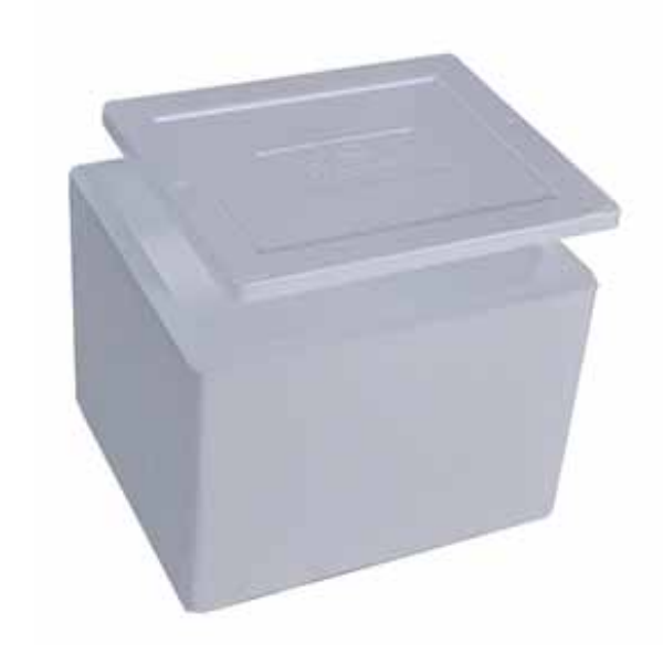
Rigifoam Freezer Box