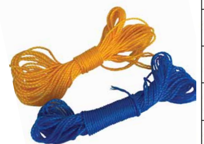
15 yards 12 yards