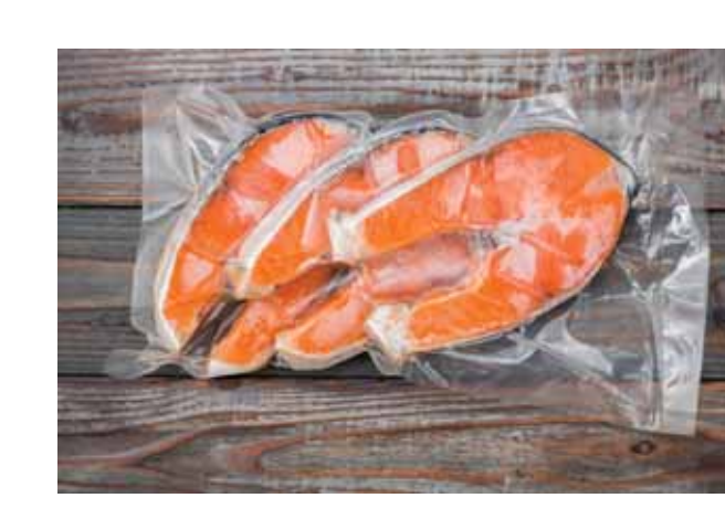
Bio Degradable Clear Vacuum Bag