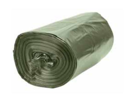
Bio Degradable Garbage Bag On Roll