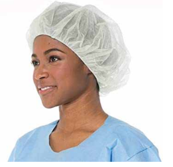
Non-woven hair net