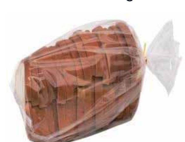
Bio Degradable Bread Bag